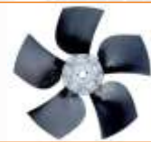
550 MM DIAMETER FAN

High Air output with uniform volume from all nozzels