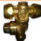
BRASS NOZZLE WITH CERAMIC TIPS