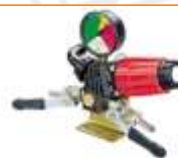
PRESURE CONTROL VALVE

5 mode pressure control valve for different discharge control