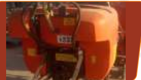
200 LITER CHEMICAL TANK

54 lpm pump for uniform pressure, less maintenance